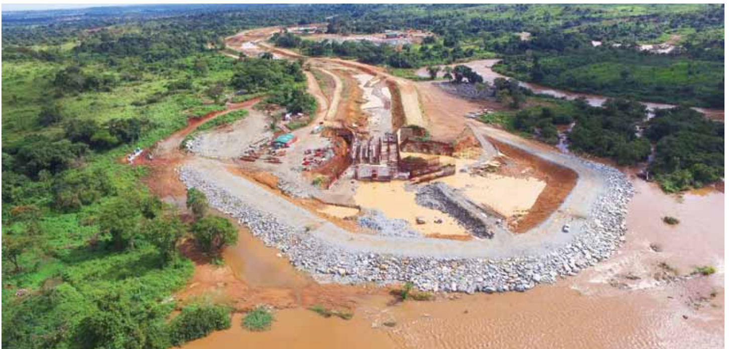
View from the intake system. The all-Congolese contracting team is making good progress with the construction of Kibali's third new hydropower station, Azambi.

"The DRC has all the materials for building a sustainable mining industry but that will require a fully committed partnership between the government on the one hand and the mining companies on the other. Despite recent indications to the contrary, we remain confident that such a partnership is within reach, and that the government will see the critical importance of maintaining a stable, investor-friendly fiscal and regulatory environment for the country's mining sector. In this regard, we would welcome the opportunity to work with the government in jointly selecting an independent group of experts to benchmark the DRC mining code and its fiscal framework and to model the impact of the new proposed code, which we believe will be damaging to the development of the industry."